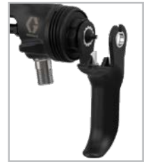
Built-in fluid cartridge removal