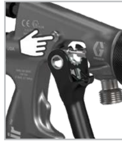
No-tool trigger removal