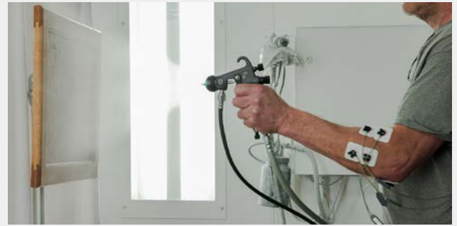
Testing shown involved spraying water during muscle effort monitoring by United States Ergonomics.

As a result of extensive research and testing, Stellair ACE and Stellair became the industry's only paint sprayers to earn Ergonomics Performance Certification.